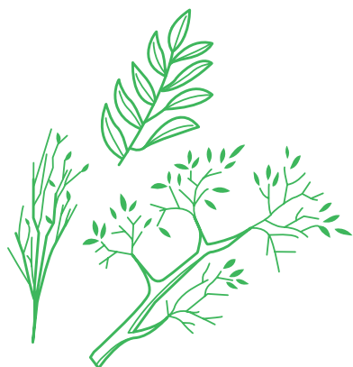
BRANCHES (SMALL BRANCHES UNDER 1M)