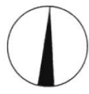
Figure 2 – CTA Building Special Control Area

12 - 14 The Esplanade & 77 St Georges Terrace