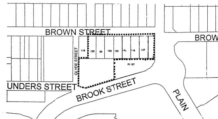
Figure 1:- Brook Street Precinct

The former No 6 electricity and gas substation at 89 Brown Street is on the state heritage register which means for proposed development advice needs to be sought from the Heritage Council of WA to ensure consistency with any endorsed conservation plan.