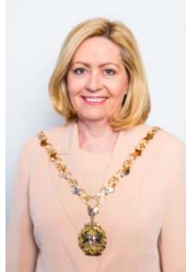
The Right Honourable The Lord Mayor Ms Lisa-M. Scaffidi