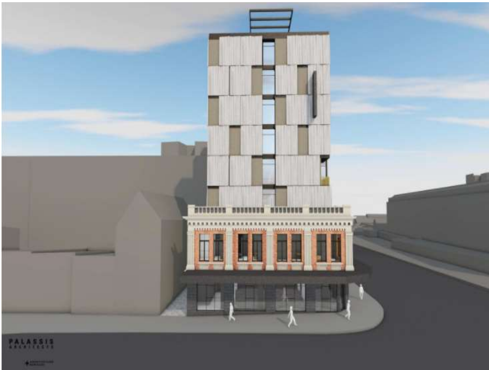
2016/5179 145 - 151 (LOT 99) BARRACK STREET, PERTH