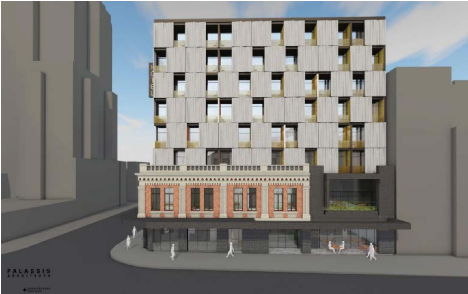
2016/5179 145 - 151 (LOT 99) BARRACK STREET, PERTH