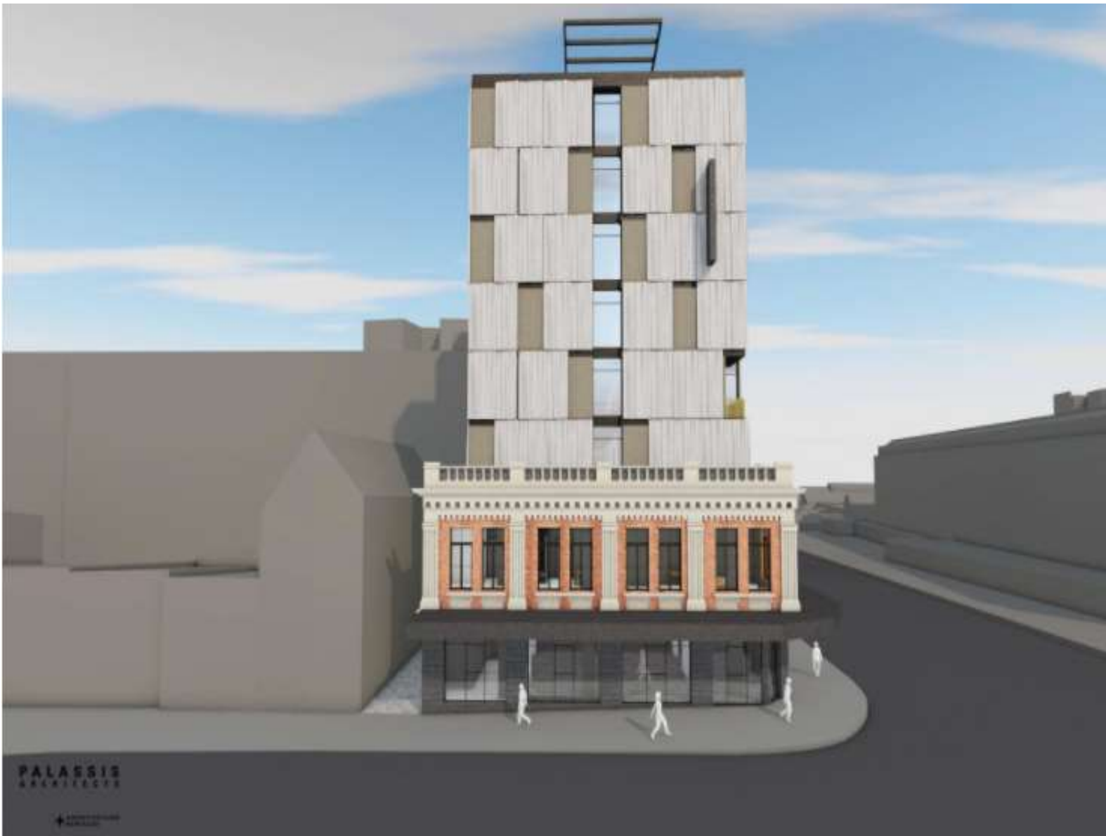
2016/5179 145 - 151 (LOT 99) BARRACK STREET, PERTH